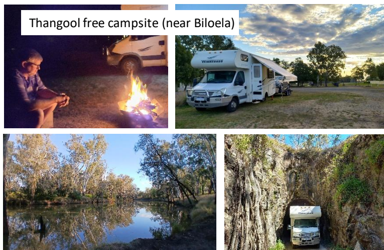
Thangool free campsite (near Biloela)

It hasn't been all work and no play. We have been blessed to experience many amazing overnight stops along the way, mostly free camping under clear skies and glorious sunsets.