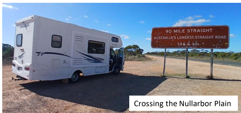
Crossing the Nullarbor Plain

Getting from A to B these past few months has certainly felt like an adventure. Since taking ownership of our Winnebago motorhome we passed the 10,000 km milestone in just 84 days!