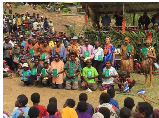
Menya New Testament dedicated in February 2018