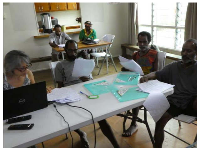
(The Malê team working with their advisor during a recent OT workshop) [New Testament dedicated 2010]

Malê: The team was surprised to learn that the Israelites and Canaanites worshipped other gods before they learned about the true God, just like their own Malê ancestors.