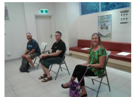
Keeping our distance while waiting for service at the bank

We found ourselves saying, "You'll work it out" in response to many issues, which we know to be true from our experience. Managing the Centre is a Kingdom task, and God will equip them and guide them as He sees fit.