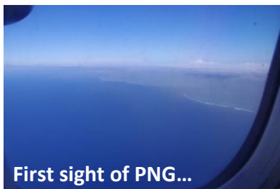
First sight of PNG...

We were definitely excited to be under way, but a 4:30am taxi ride to Cairns airport was just the beginning of a very long day.