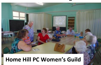
Home Hill PC Women's Guild

Pray that these opportunities to speak might lead to relationships which will be a blessing for all.